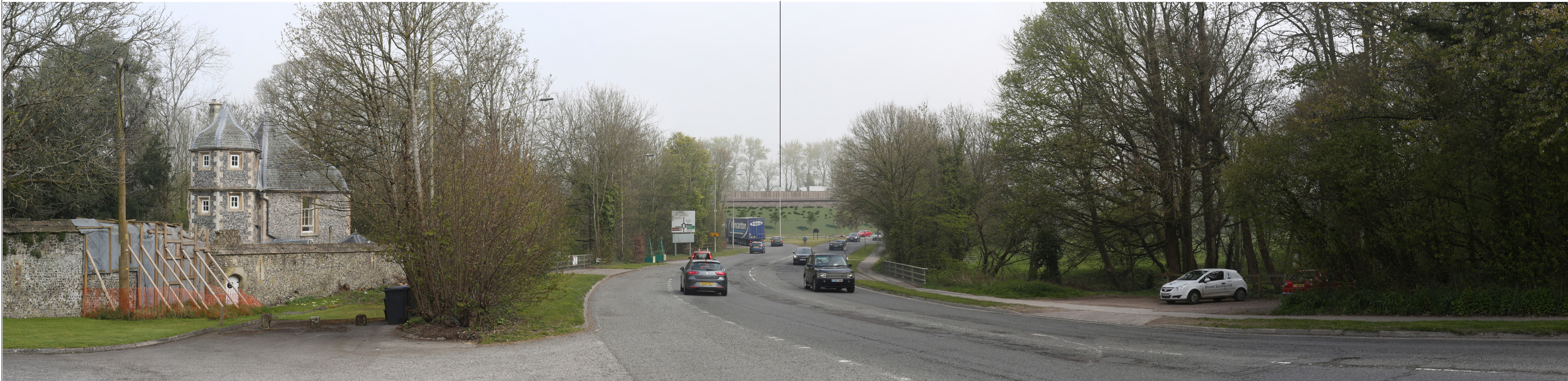
PROPOSED (WINTER YEAR 1)